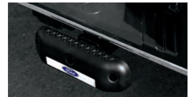
HITCHSCAN REAR PARK ASSIST SENSOR AND HITCH STEP BY ROSEN FLA HitchScan activates whenever you shift into reverse, providing an audible alert and visual indication when it detects an object. 15K859