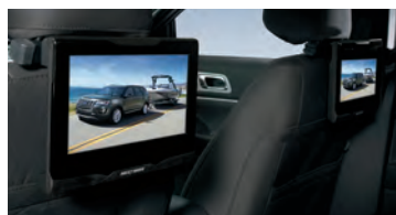
REAR SEAT ENTERTAINMENT – PORTABLE DVD PLAYER, DUO CINEMA FLA Two 10.1 inch screens with 1024 x 600 resolution. Capacitive touch controls on the face of monitors. 10E947