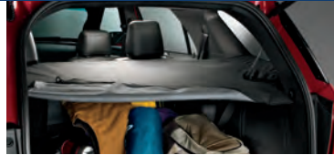
CARGO SECURITY SHADE Mounts behind the rear seat above cargo area to help conceal your belongings. Available in Black. 7845440