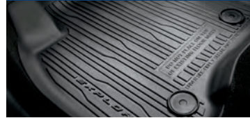
FLOOR LINER - TRAY STYLE Helps provide maximum protection from spills, dirt and grime. 7813300