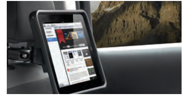
TABLET CRADLE BY LUMEN FLA Safely and securely holds the tablet while maintaining functionality. 19A464