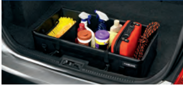
SOFT-SIDED STANDARD, POP-UP Premium-grade, woven-polyester organizer. 78115A00