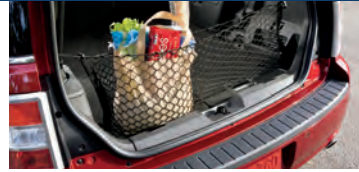
CARGO NET The net stretches easily over bulky items and the soft braided cord won't damage painted surfaces. 7855066, 78550A66