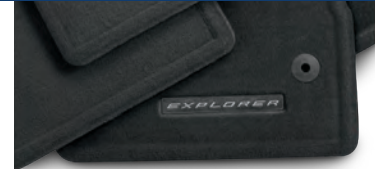
FLOOR MATS - CARPETED Premium-grade carpeting is custom fit to the exact contour of each vehicle. 4 pieces. 7813300