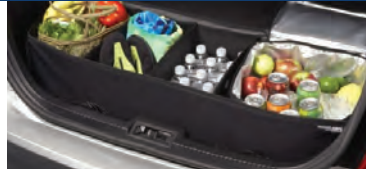
SOFT-SIDED LARGE, FOLDING Folds open to 4 sturdy compartments. 78115A00