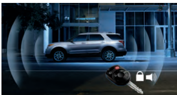
VEHICLE SECURITY SYSTEM Helps protect your vehicle and its contents with a state-of-the-art security system. 19A361