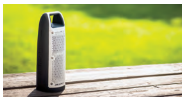
BULLFROG PORTABLE BLUETOOTH® SPEAKER FLA Stream Bluetooth audio with the Hop † and Jump speakers. 18808