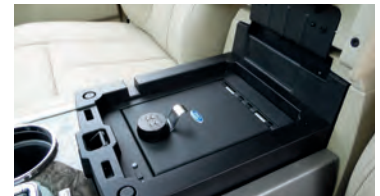
VEHICLE SAFE BY CONSOLE VAULT® FLA Spring assisted lid for easy opening. Constructed of 12 gauge cold-rolled plate steel with welded tab and notch seams. 9906202