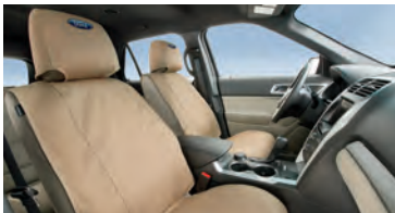
SEAT COVERS BY COVERCRAFT® FLA Custom patterned to allow access to seat controls and are compatible with seat mounted side airbags. 78600D20, 7863812