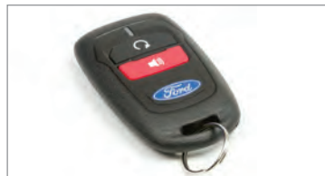
REMOTE START SYSTEM Enjoy the comfort and convenience of a pre-warmed or pre-cooled vehicle. Available in a variety of options. 15K601