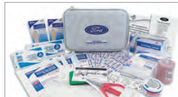
FIRST AID KIT FLA First aid kits keep your supplies in a fire-retardant, compact case that's the perfect fit for your vehicle. 19F515