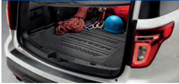
CARGO AREA PROTECTOR Durable, lightweight, polyethylene tray with a raised lip to help contain spills. Available in two options. 6111600