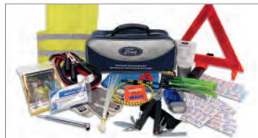
ROADSIDE ASSISTANCE KIT FLA Kit contains many items to help make you prepared for nearly any roadside emergency. 19F515