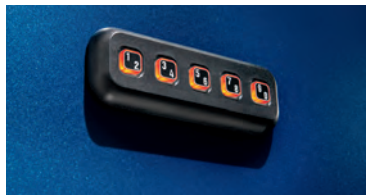
KEYLESS ENTRY Conveniently unlock your vehicle without your key or keyless entry remote. Note: Not available with push button start. 14A626